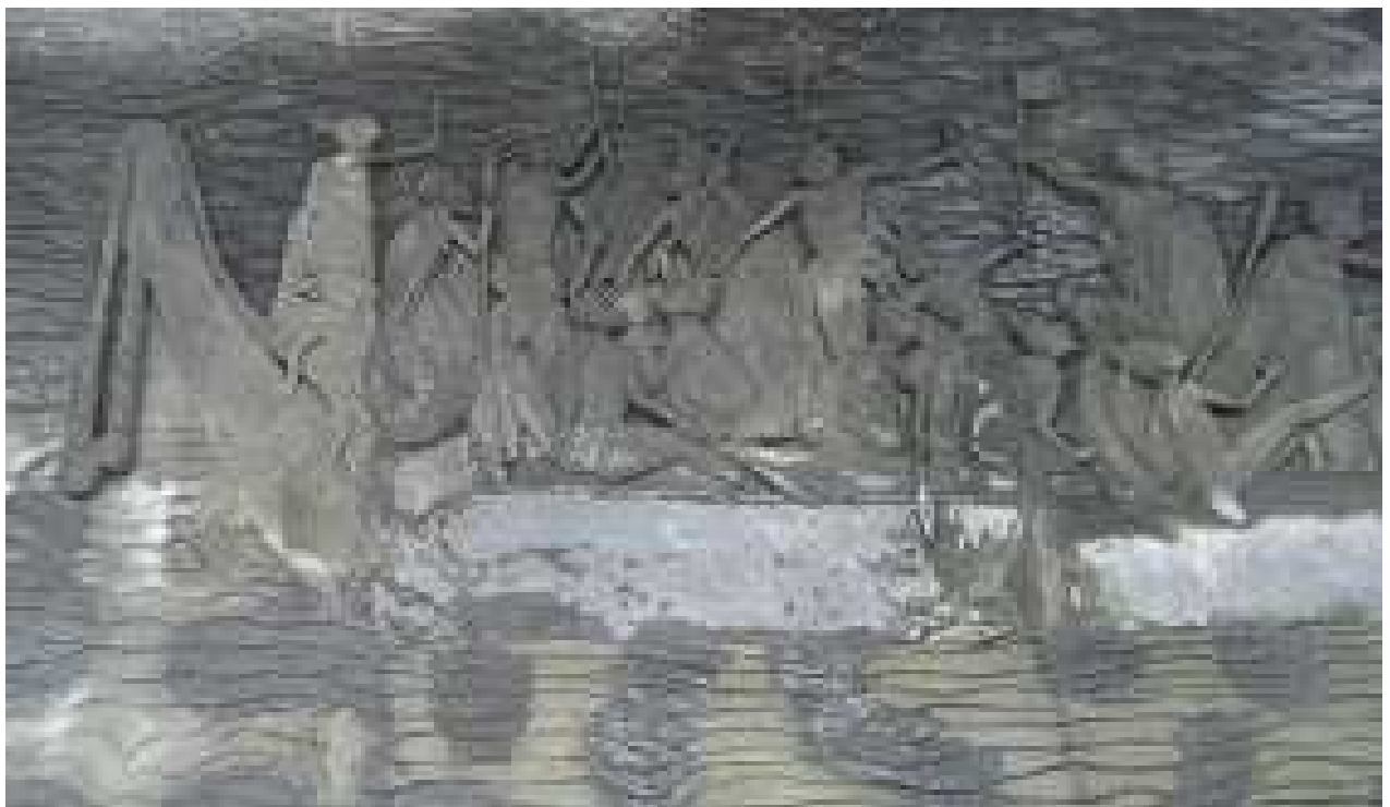
Zen Garden Carved Water Feature