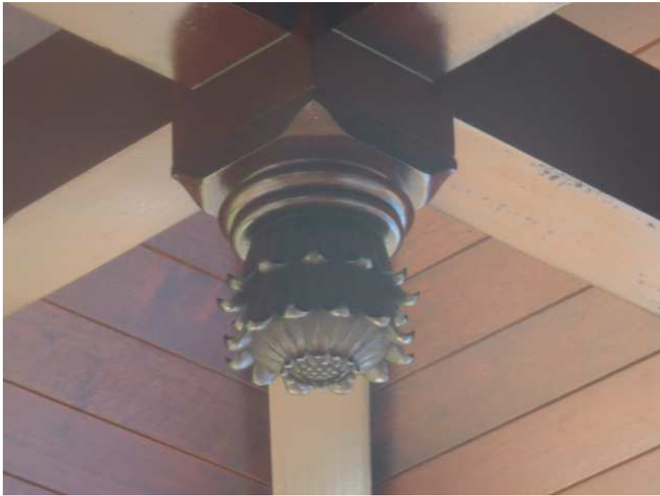
Carved Lotus Flower at King Posts