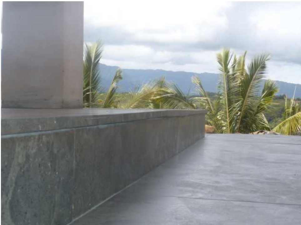
Green Andesite Tile Work