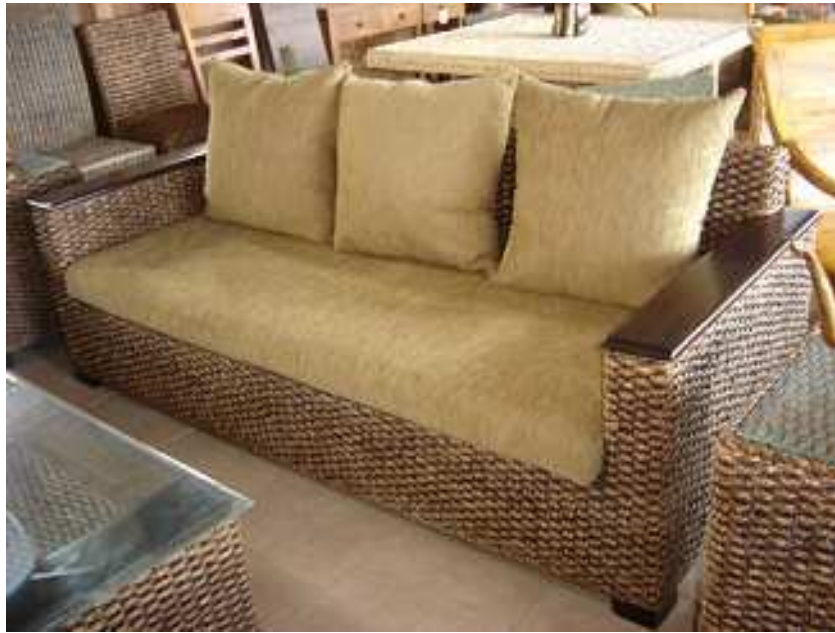
Eco-friendly Hyacinth Furniture