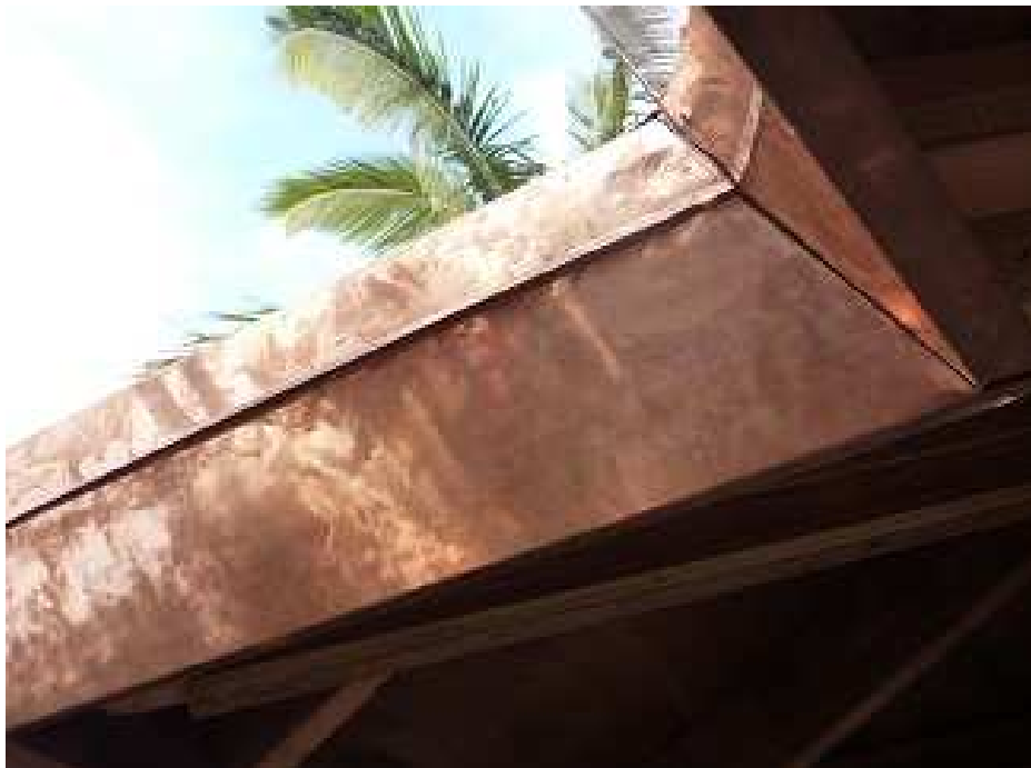
Copper Clad Fascia