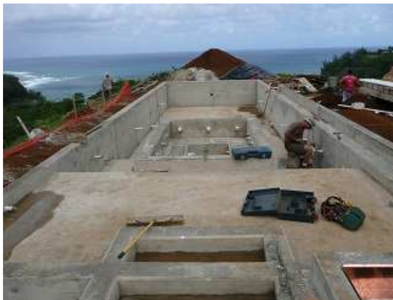
Elevated Slab in Foreground has 5000 Gallon Cistern under for Irrigation Water Requirements