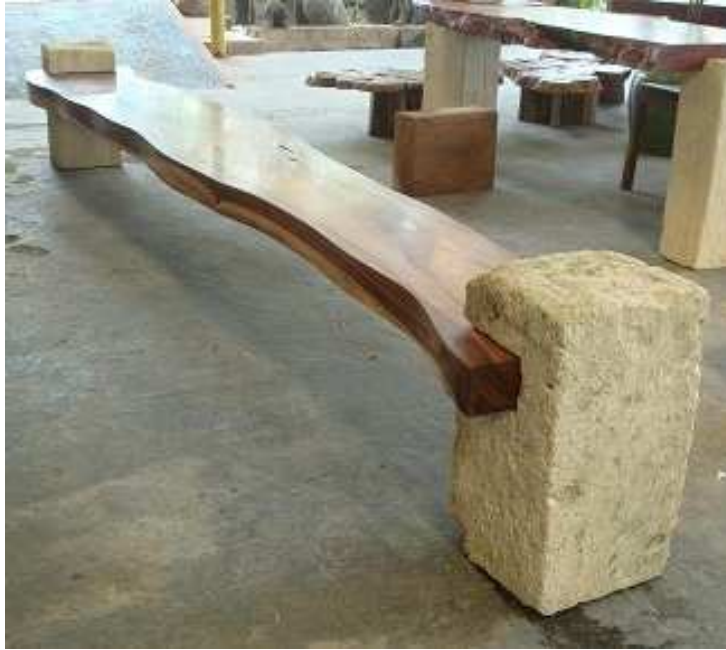
Modern Primitive Bench