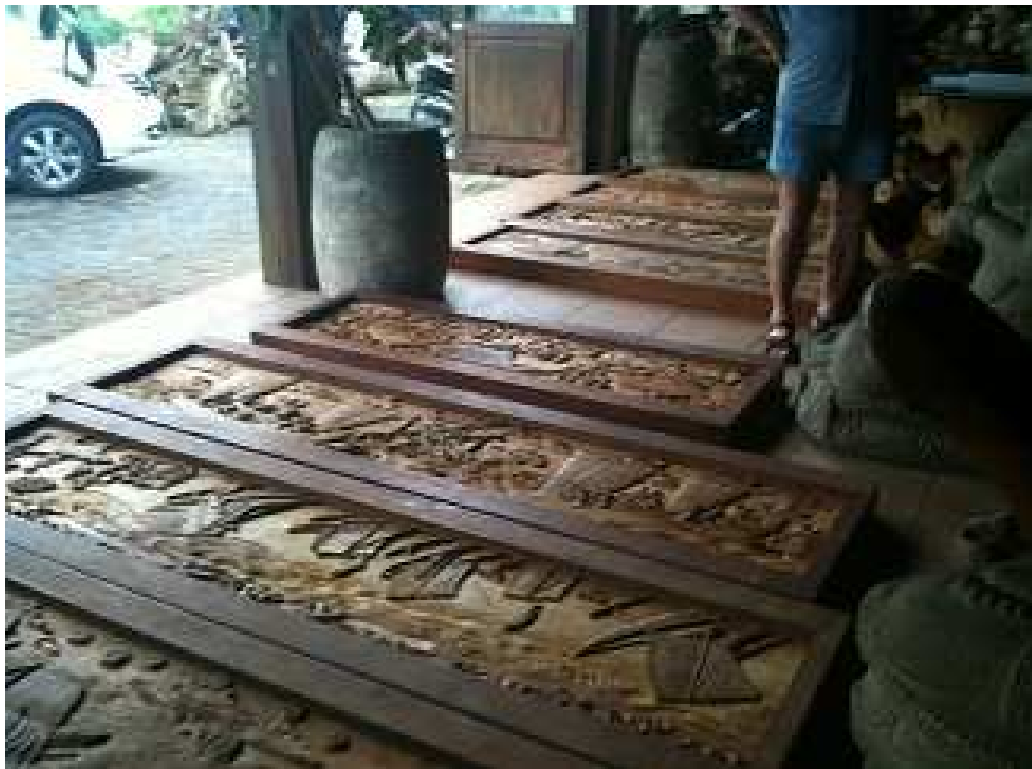
Finishing the Main Lanai “Grand Saga” Panels