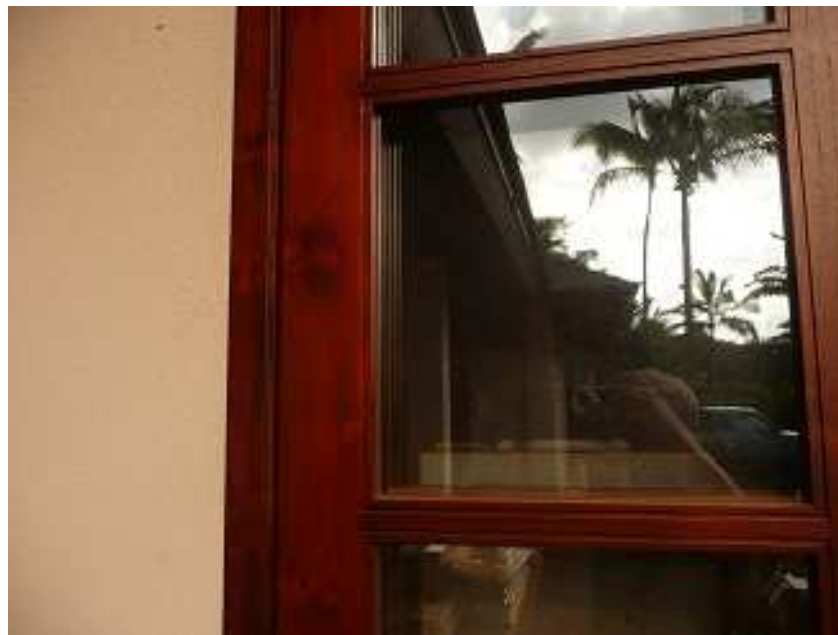
Low- E Glass Window Shown with Finished Plaster