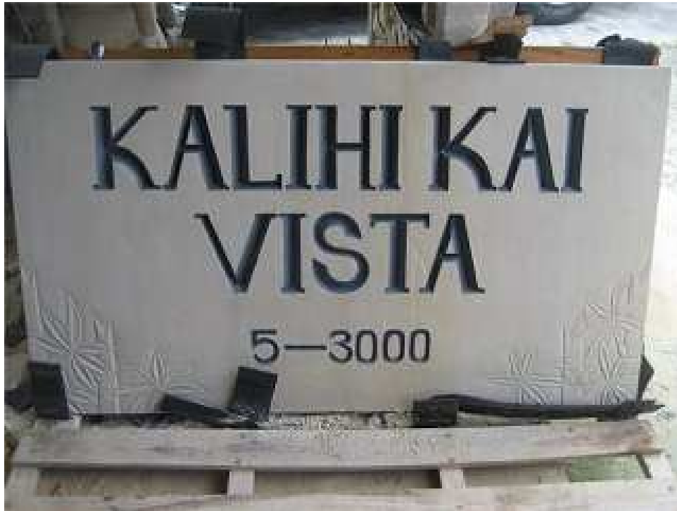
Kalihi Kai Vista Road Sign