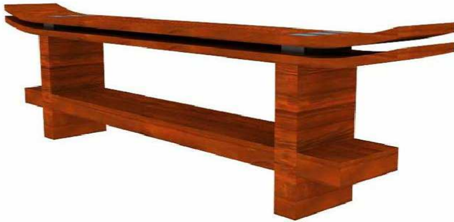
Reclaimed Teak Zen Table