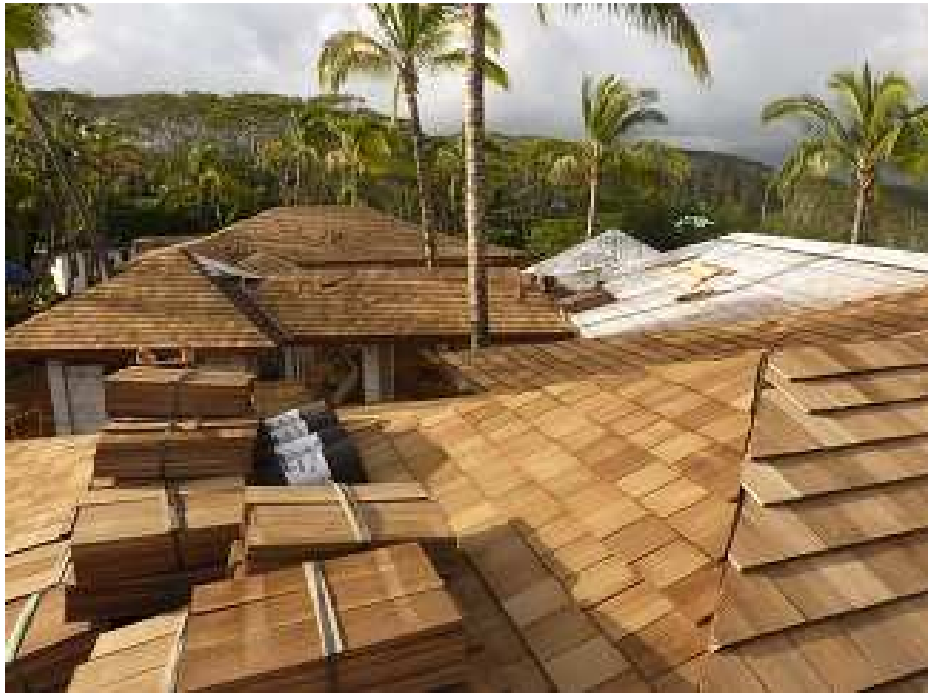
FSC Cedar Shake Roof being Installed