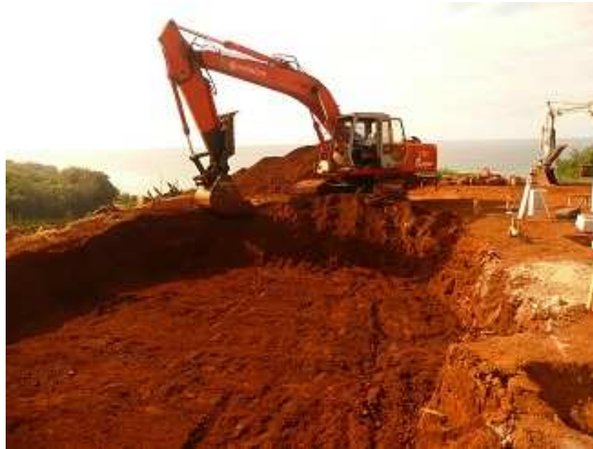
First Days of Excavation