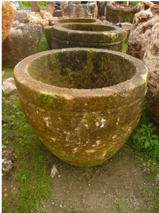
Zen Garden Antique Planter