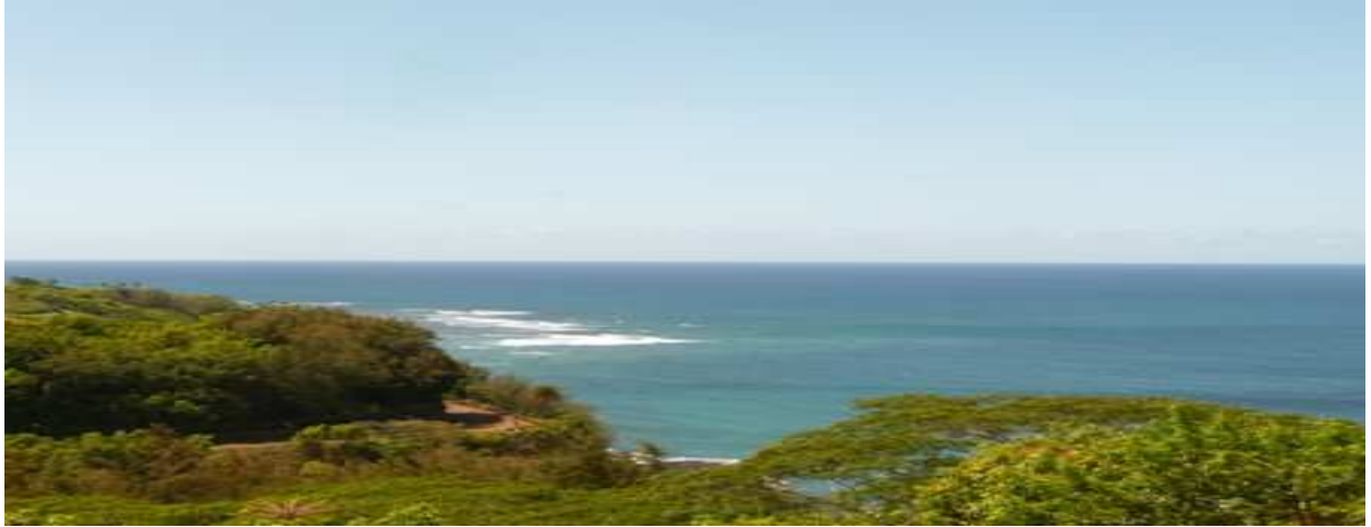
Wires Surf Break at Anini Reef and the Pacific Ocean Beyond