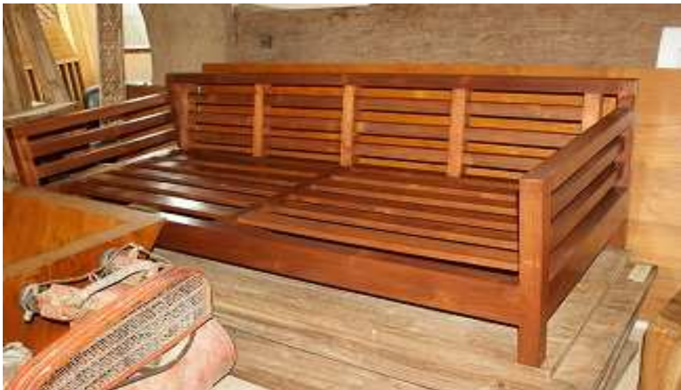
Reclaimed Teak Day Bed