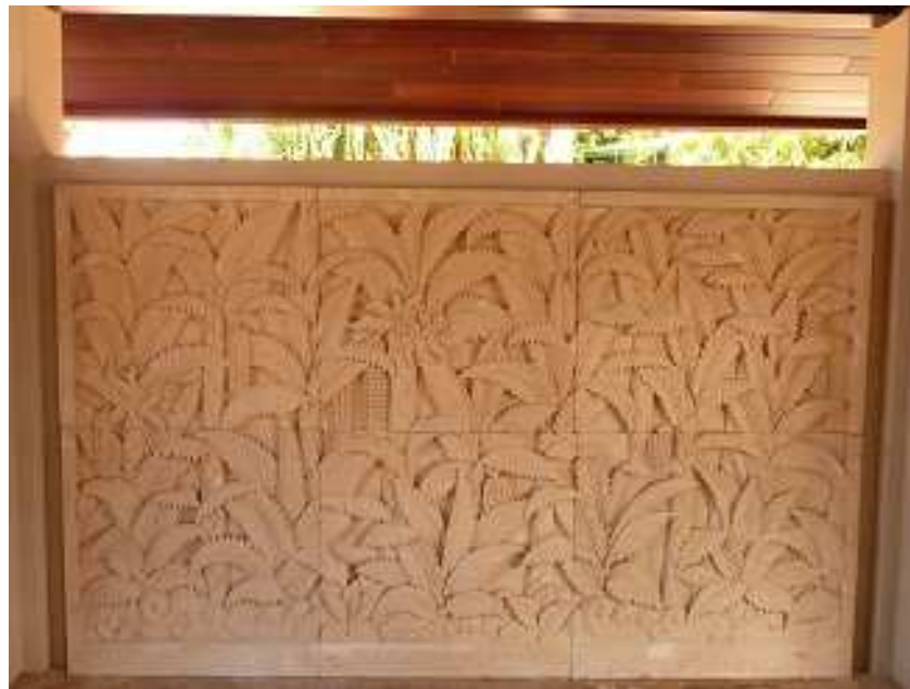
Limestone Panel at Entry Bale