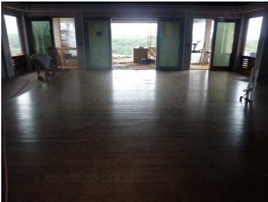
Great Room Hardwood Floors