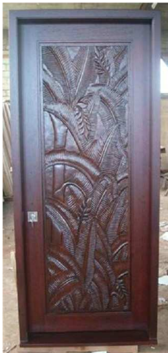
Haliconia Carved Door