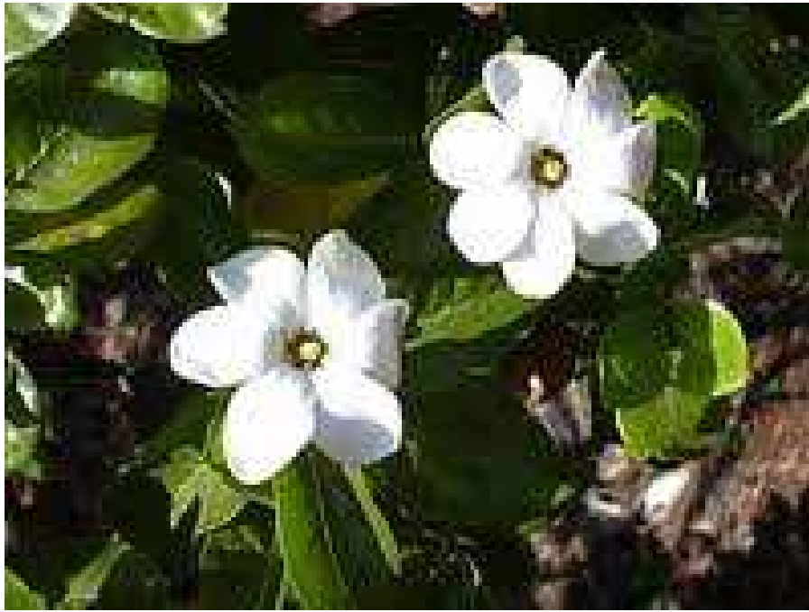
Planting Kaua'i Native Fauna