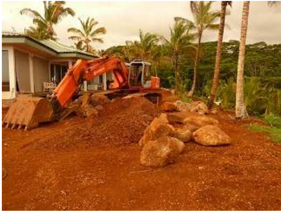
Boulder Walls for Erosion Control