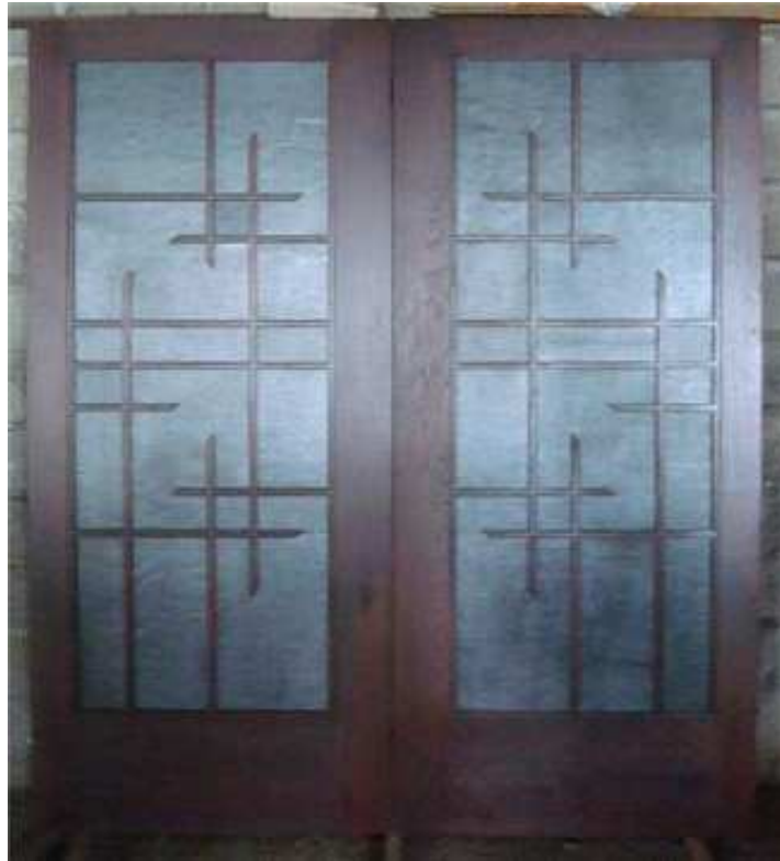
Entry Bale Copper Clad Doors