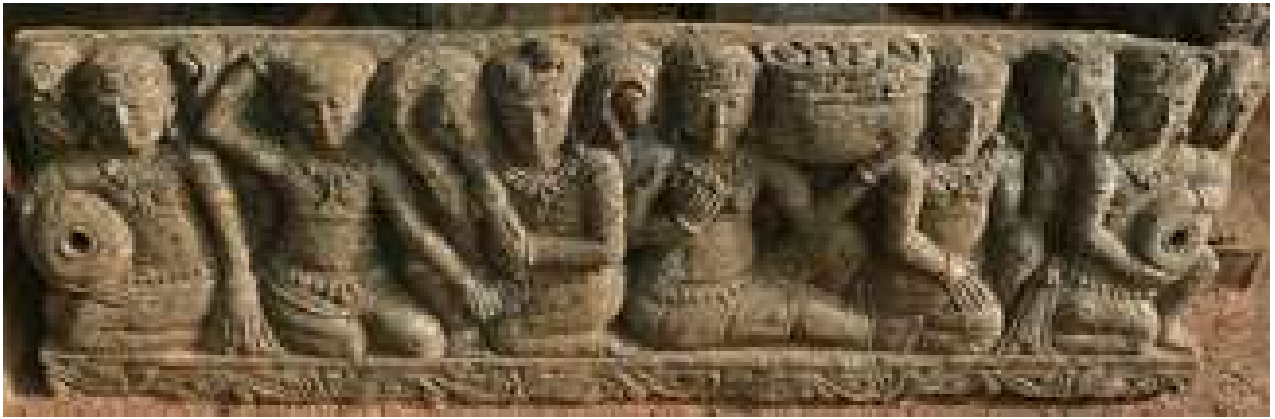
Zen Garden Antique Stone Carving