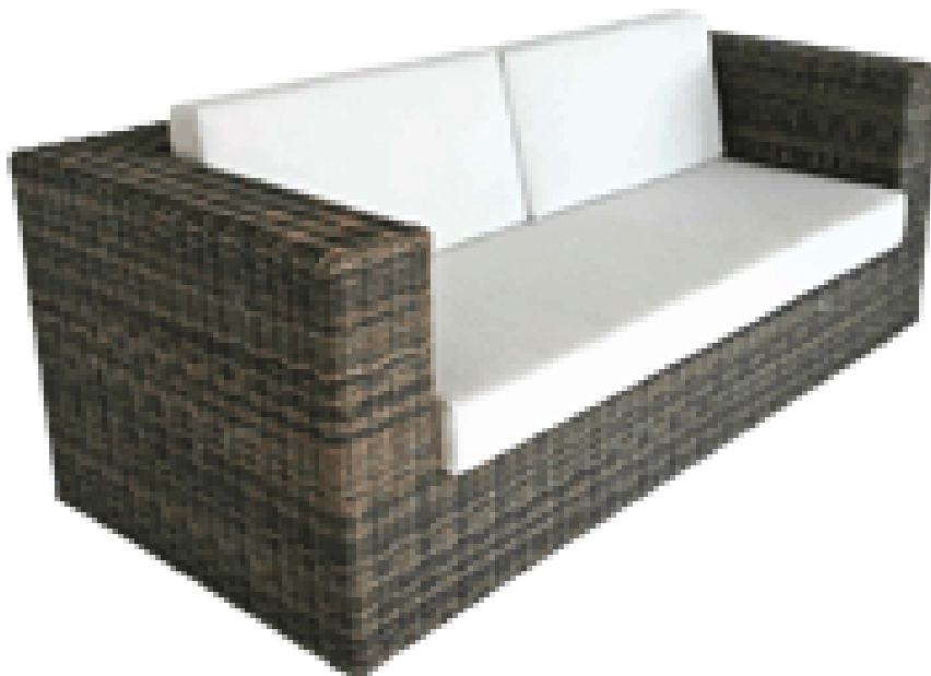
Eco-friendly Recycled Synthetic Outdoor Furniture