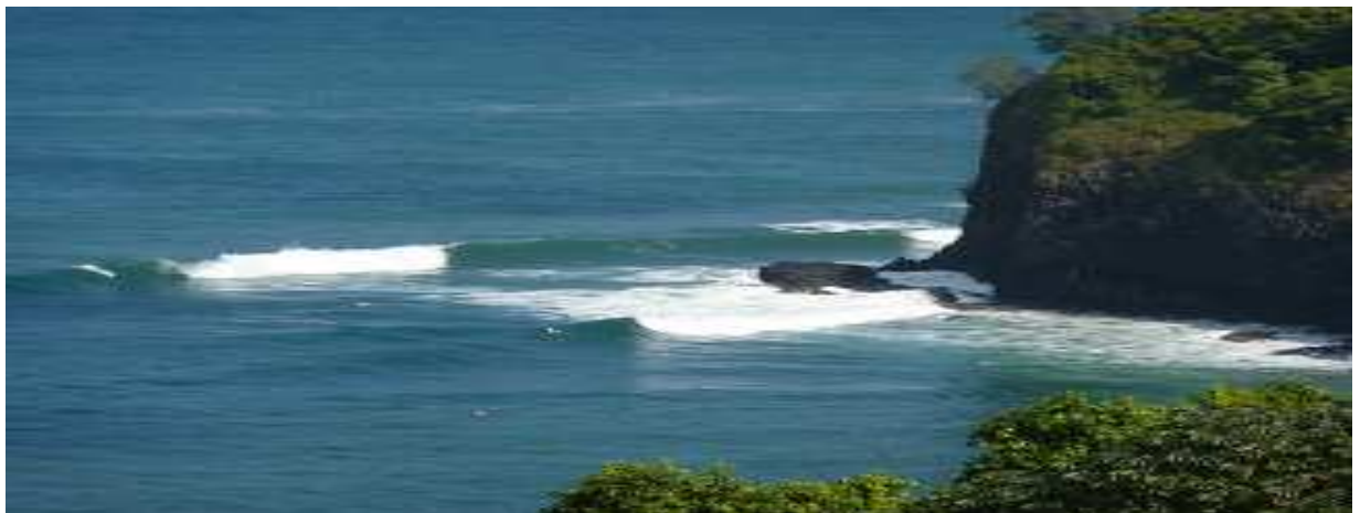
Famous Kalihiwai Surf Break View from Whale Watching Tower