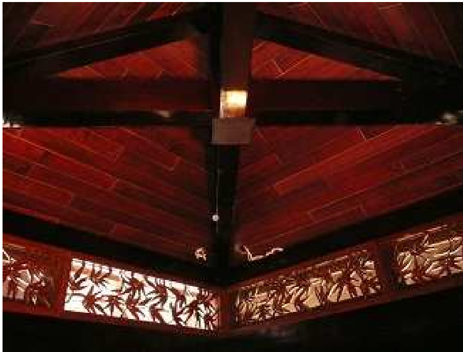
Cupola Finish Work