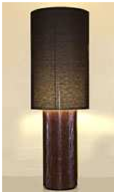
Tall Floor Lamp for Great Room