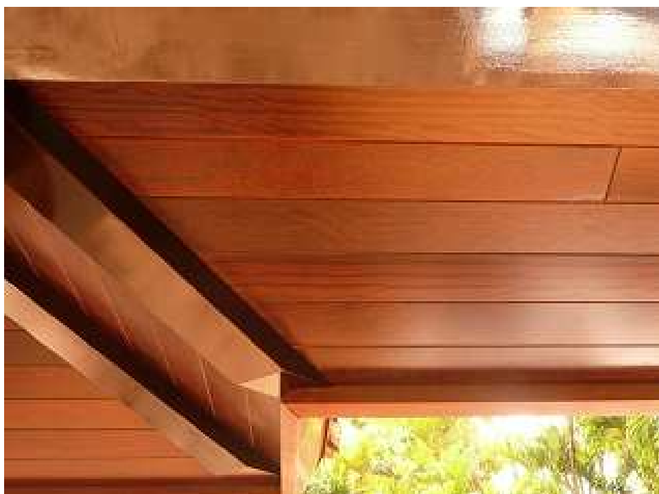
Wood Work before Final Finishing