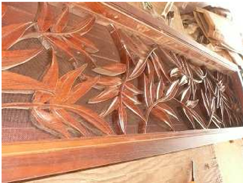
Bamboo Leaf Cupola Window