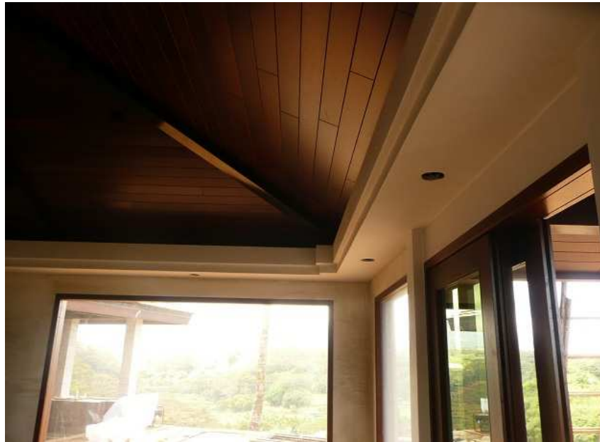
Interior Plaster Work