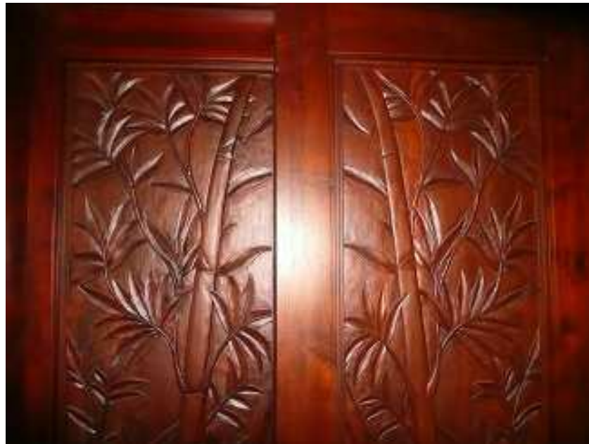
Carved Closet Doors