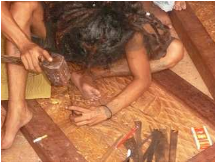
Carving the Main Lanai “Grand Saga” Panels