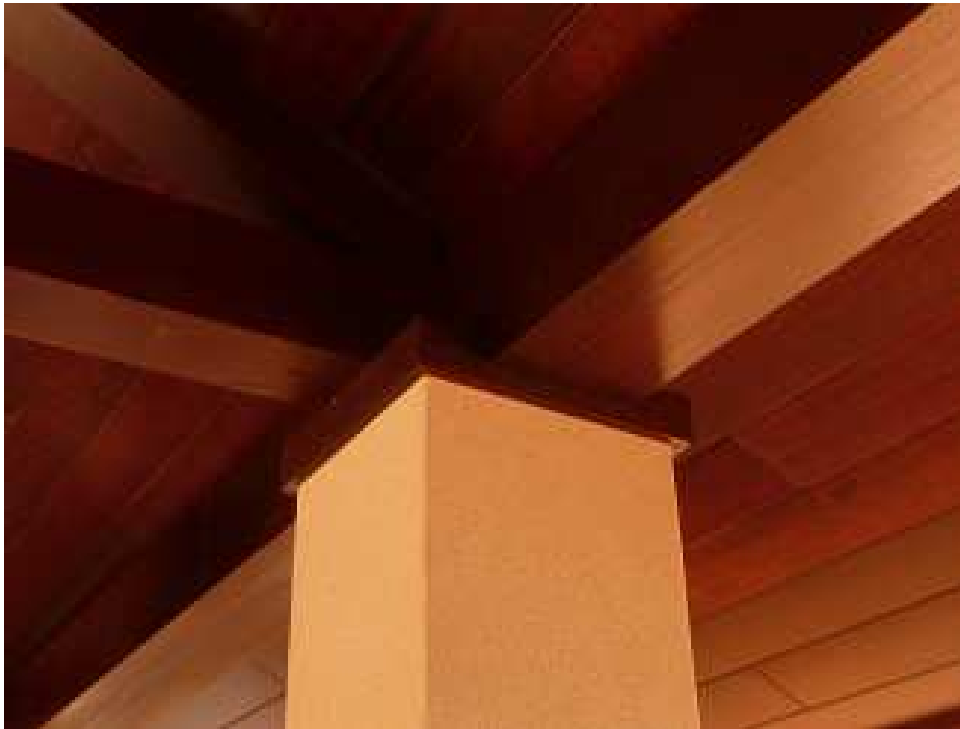
Breezeway Beams and T&G Ceiling