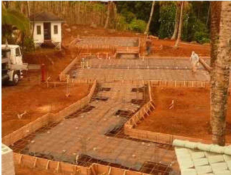
Foundation Work to LEED Specifications