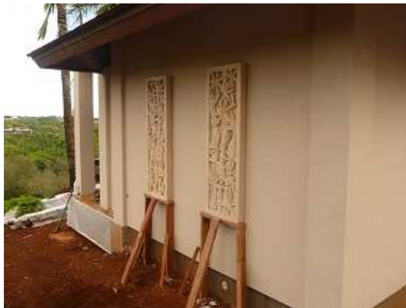
Installing Limestone Panels at Master 2 Bathroom