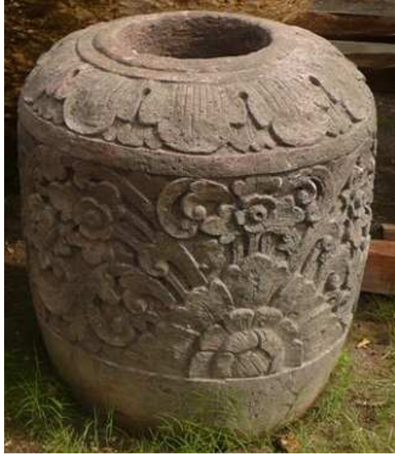
Antique Carved Planter