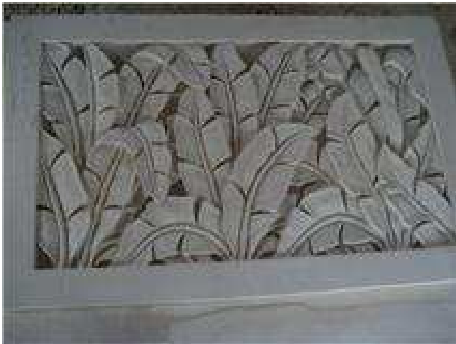
Kai Vista Carved Limestone Panel