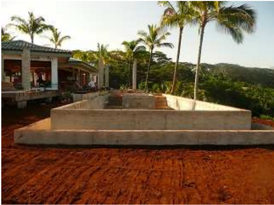
55' Infinity Pool with Spa, Reef, and Fire Pit