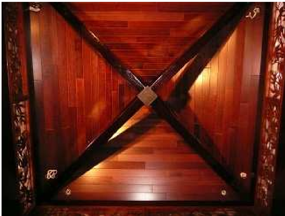
Cupola Finish Work