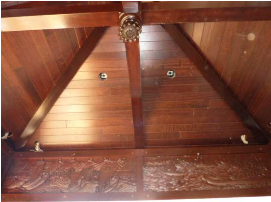
Main Lanai Carved Panels