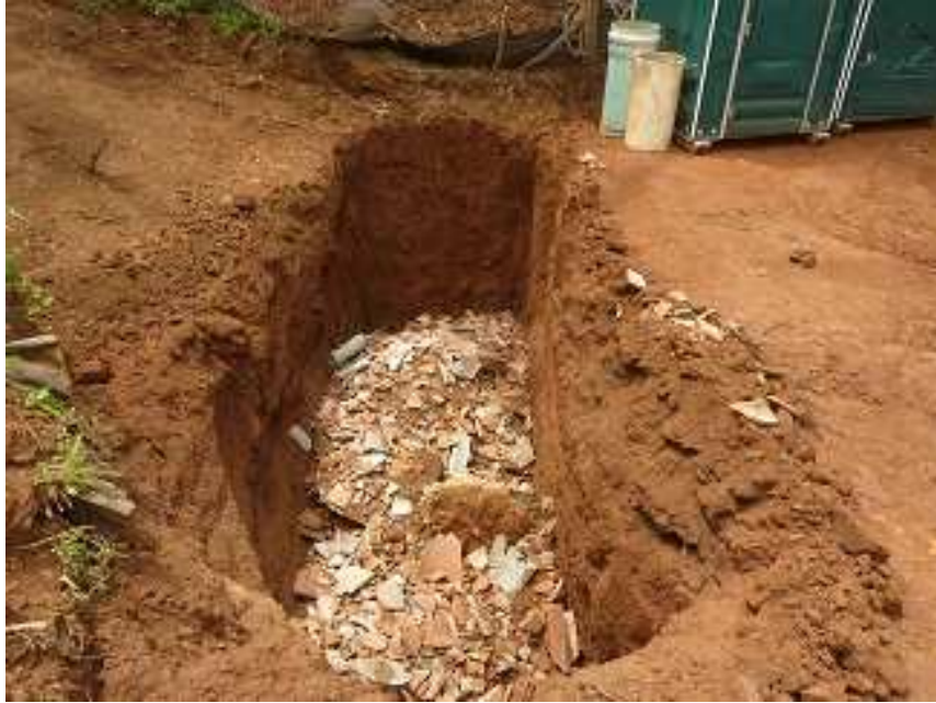
Drywell to Capture Excess Run-Off