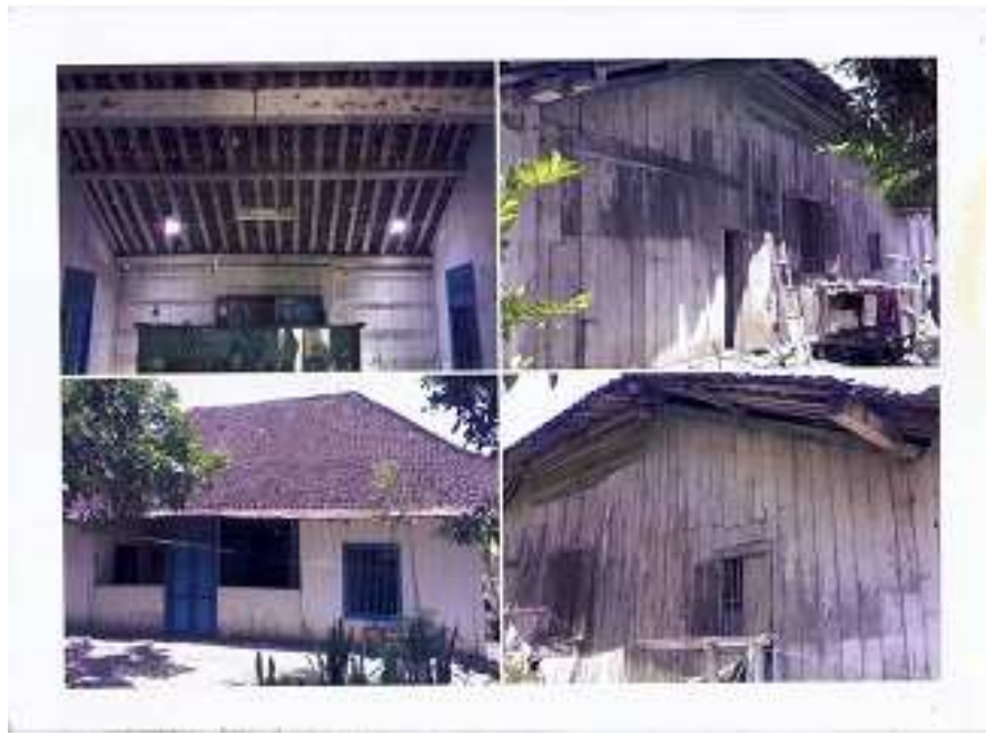
The Old Teak Houses Demolished with Wood Reclaimed for Kai Vista Windows and Doors