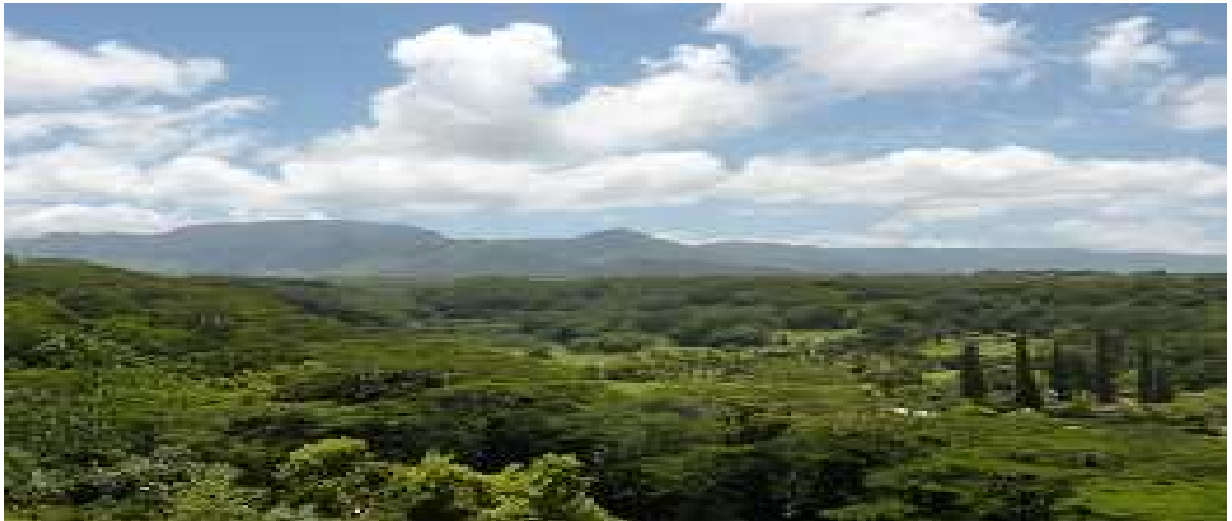
Nakamara Mountain View and Kalihiwai Valley